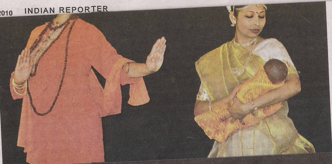
A scene from Shakuntala.

Days pass by, but no one from the palace comes to take Shakuntala to her beloved husband. Sage Kanva sends her to the royal court to meet the king, as she is pregnant with Dushyant's heir. On her way to the court, Shakuntala's signet ring accidentally drops into a river and a big fish