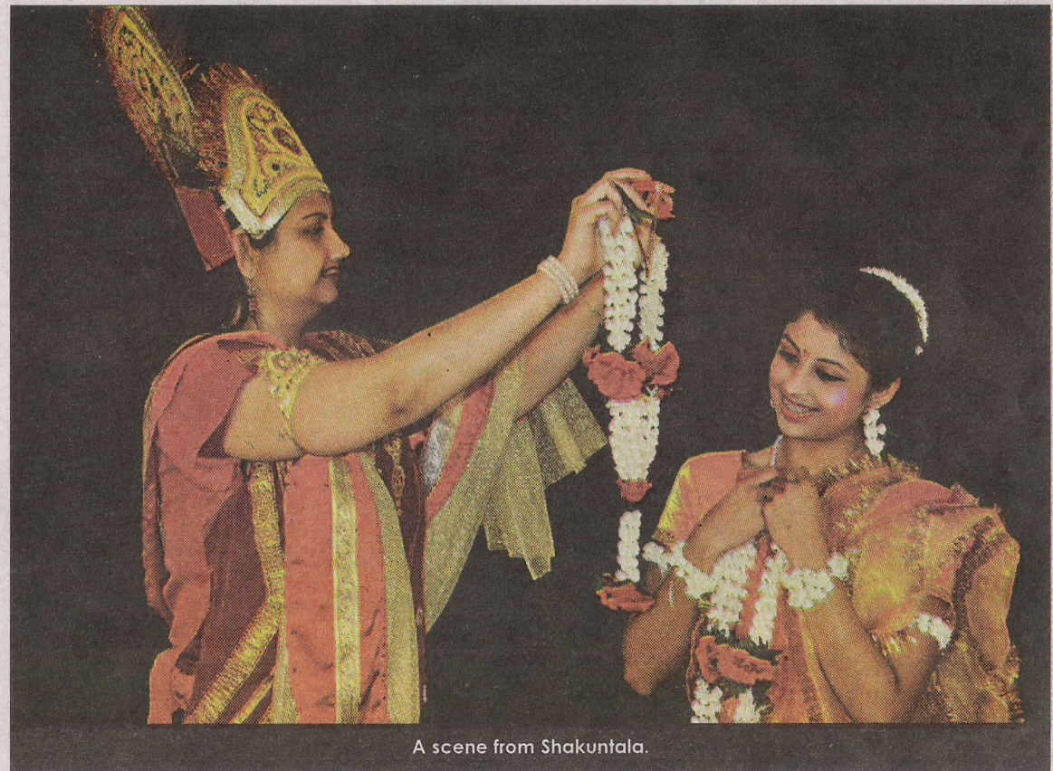
A scene from Shakuntala.

In the mean time, a fisherman has accidentally caught the fish that had swallowed the signet ring. On cutting the fish, he gets the ring and takes it for selling to a jeweler who recognizes the royal signet ring and produces it before the king. On seeing it, Dushyanta comes out of the spell and remembers all about Shakuntala. Overcome with guilt for his failure to recognize his wife,