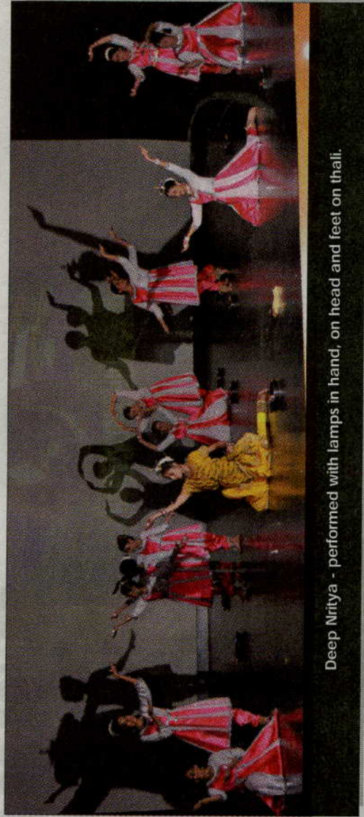
Deep Nritya - performed with lamps in hand, on head and feet on thali.

The program featured more than 60 dancers and was presented using six major dance forms around the world including